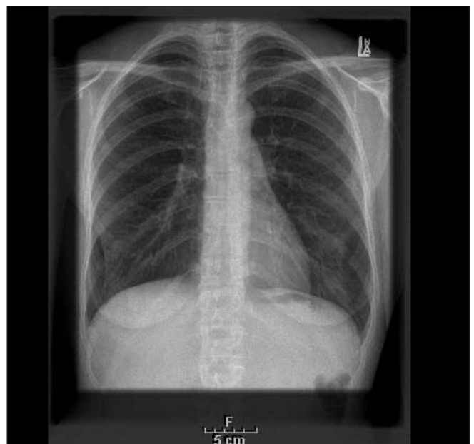
Fig. 1. Results of chest x-ray taken 5 days after the incident.

Although rare in people exercising on land, pulmonary edema is more routinely reported in individuals participating in swimming or other immersion-related sports. 10 Adir and coworkers describe a series of 70 teen athletes who, over a 3-year period, developed SIPE. 10 All cases occurred in trainees who were swimming semi-reclined in warm